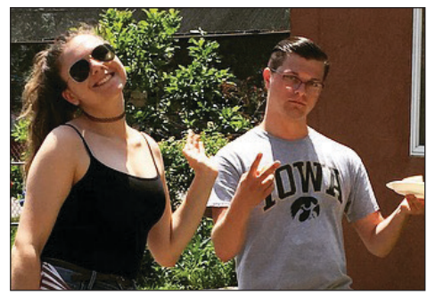
Peace Camp, Tubman's annual summer camp for youth in our residential programs, kicked off with an ice cream party and continues with themed activities each week. More youth of all ages are participating this year.

Across the state, the length of stay in domestic violence shelters is becoming longer each year. While every situation is different, at Tubman our average total length of stay went from 39 days in fiscal year 2014 to 76 days in fiscal year 2017. This is in part due to the lack of available affordable housing in our region, which has worsened dramatically during these years. There is, however, another dynamic at play: counties have implemented a system of coordinated